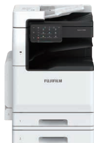
With 1 Tray Module

Standard Tray • 520 sheets capacity tray x 1-tray