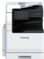
Standard Configuration 1 Tray

Standard Tray • 520 sheets capacity tray x 1-tray