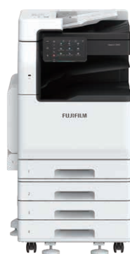
With 3 Tray Module

1 Tray Module with Cabinet • 520 sheets capacity tray x 2-tray • Cabinet