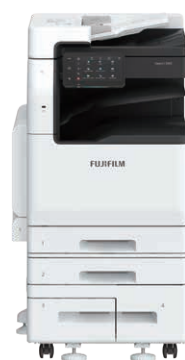
With Tandem Tray Module

3 Tray Module • 520 sheets capacity tray x 4-tray