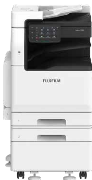
With 1 Tray Module with Cabinet

1 Tray Module • 520 sheets capacity tray x 2-tray